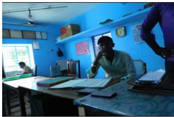
Village branch of Kajahbeedi

Visits to village branch of Chandrikabeedi and Kajahbeedi, in Tirunelveli district, gave a glimpse into the process when the workers come in the shop. Behind a long table a supervisor was sitting receiving, checking and calculating the rolled beedis brought by the women workers; next to him sat a clerk making entries in register and in her passbook; and then another person was sitting in the corner weighing the raw material (tobacco, rolls of tendu leaves) and giving it away to the women. Women workers from the same village and from the nearby villages come on the scheduled time to deposit the rolled beedis and to collect raw material for the next lot. Women from the same village or closer by villages are given raw material enough to roll beedis and deposit back by next day but to women who are from far off villages raw material is given in comparatively larger quantity so that they can come back in 3-4 days to deposit their rolled beedi bundles.