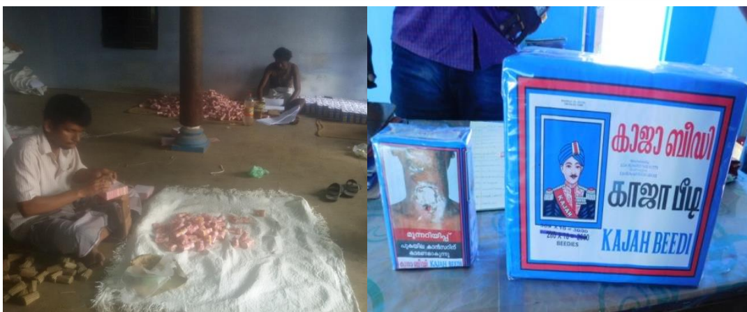
Packaging and labeling process Beedi packet with warning

In Thoothukudi district in a few villages, cutting of beedis was done exclusively by some women, to be collected by the leaf supplier later on. In these villages people do not know how to roll the beedis. These villages were inhabited predominantly by people from the SC community. In Vellore district the practice of supply of raw material and collection of the finished product is done by the agents.