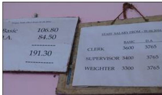
Wage rate displayed in village branch office

In Thoothukudi district in a few villages, cutting of beedis was done exclusively by some women, to be collected by the leaf supplier later on. In these villages people do not know how to roll the beedis. These villages were inhabited predominantly by people from the SC community. In Vellore district the practice of supply of raw material and collection of the finished product is done by the agents.