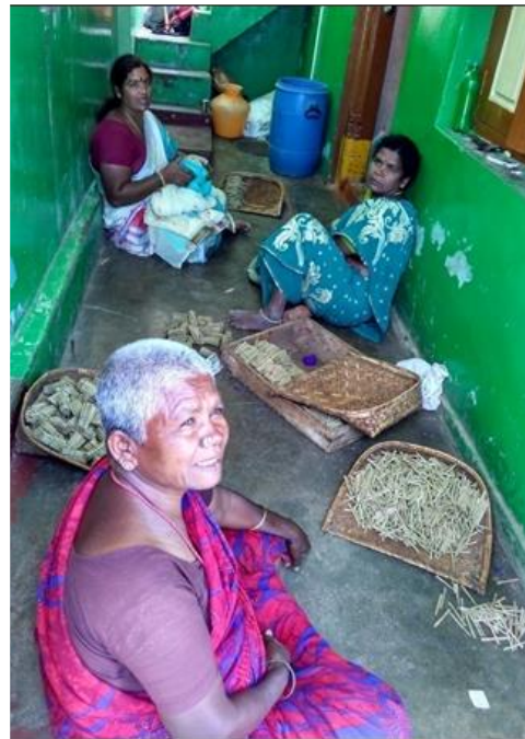
Cramped Working Conditions of the workers

Most dwellings of the beedi workers are poorly maintained with unclean surroundings. Many of them don't have their own houses and instead stay in rented dwellings which add to their burden. This is the situation particularly in the urban areas. Within the villages the situation of those coming from the SC community is the worst because most of them don't own any land. Apart from that they also face discrimination at multiple levels.