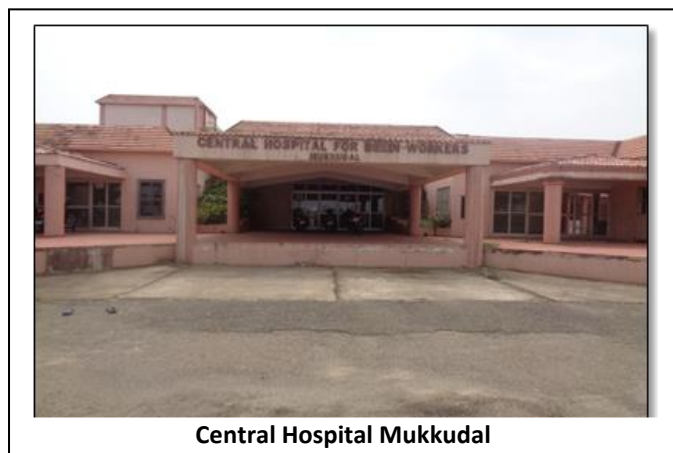
Central Hospital Mukkudal

The Beedi Workers Hospital at Mukuddal town in Tirunelveli District is the only one in Tamil Nadu for beedi workers. It started as a dispensary in 1983 and, in 1987, was upgraded to a hospital, with 28 beds. It functions under the Ministry of Labour, Commissioner of Welfare. There are 6 staff nurses and 2 doctors apart from the CMO. It serves the population coming under a 15 km radius of the hospital.