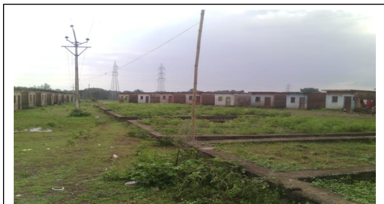
Colony constructed for Beedi Workers in Satna

A visit was made to beedi workers housing society in Sohawal block of Satna district where a group meeting was done with the workers. The colony was made in 2004 by a contractor. Majority of the houses were in a dilapidated state with water leakage during the monsoons. The