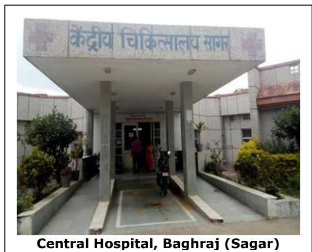
Central Hospital, Baghraj (Sagar)

In contrast to the Jabalpur hospital which was well known, we faced difficulties in even locating Central Hospital in Baghraj of Sagar district. Barring few workers who lived close to the hospital, nobody knew about the hospital in the local community. It is locally known as 'BeediAspataal'. On the outside, the