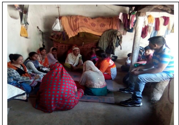
Group discussion with beedi workers in

In-depth interviews with key informants drawn from important stakeholder groups, and focus group discussions with beedi workers were the main data collection methods used. The study was carried out in November, 2016 in Jabalpur, Sagar and Satna districts, which are three important beedi producing districts in Madhya Pradesh. The table (Table 1) below lists the people we met.