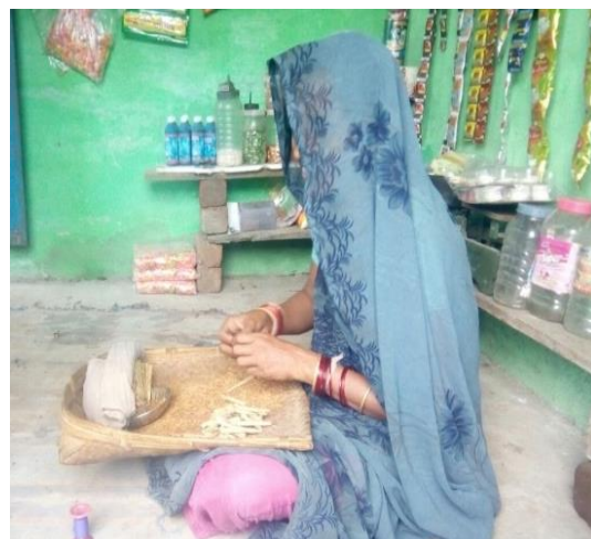
Woman rolling a beedi in her house while also managing a small shop

Beedi rolling is a home based activity in Madhya Pradesh and the system of production is through contractors or middlemen called sattedars or thekedars . The beedi manufacturer usually has a factory or workshop and a large godown where raw materials are stored and given to sattedars . The sattedars , in turn, have their storerooms in areas where beedi workers live. Beedi workers are now largely women. Workers are given raw materials to roll into beedis which they return to the sattedar and are paid per 1000 beedis.